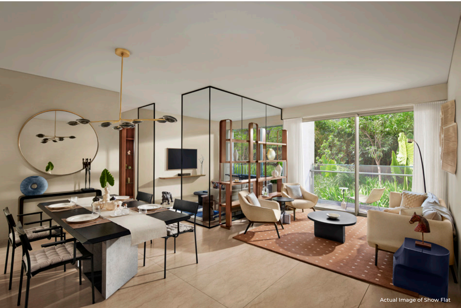
Actual Image of Show Flat

Homes at Forestville are an ode to the intricacies of luxury and the undisturbed expanse of mother nature.