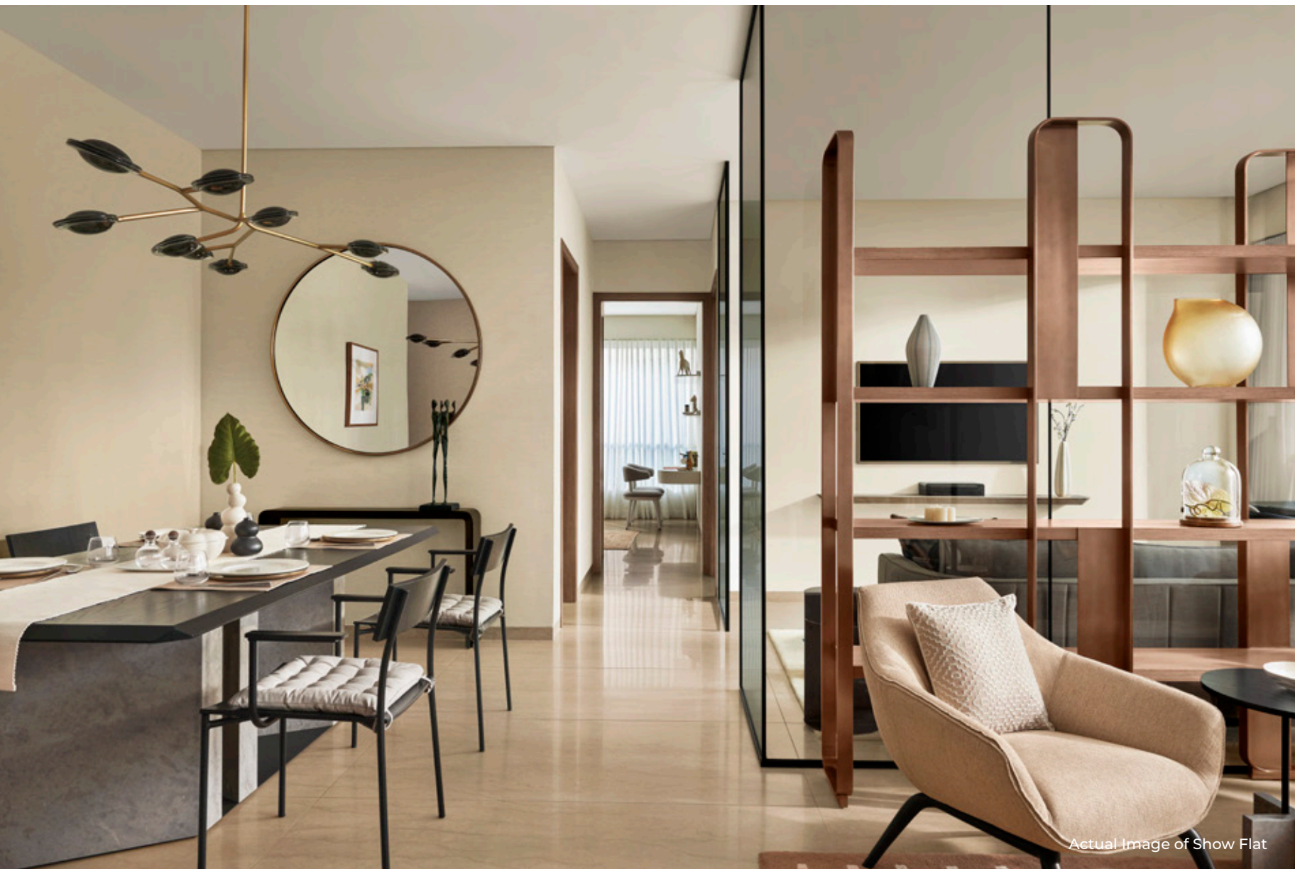
Actual Image of Show Flat

Disclaimer: This advertisement material does not constitute an offer and/or acceptance and/or contract and/or agreement and/or transaction and/or any intention thereof and/or a disclosure under any statute of any nature whatsoever. The pictorial/other representations herein, the layout, number/orientation of buildings/towers/wings/structures, facilities and amenities are merely creative imagination and an Architect's impression and are only indicative, actual product may vary/differ from what is indicated herein. No representation or warranty is made or intended as to the accuracy or completeness of information under this advertisement/promotional document or as to its suitability or adequacy for any purpose. Before making a decision to purchase, you are requested to independently, either directly or through your legal/financial consultants, thoroughly verify all details/documents pertaining to this project as available on https://maharera.maharashtra.gov.in/ under the MahaRERA Registration No. P51700050312. For detailed disclaimers refer to page Disclaimers (Page no. 30) all of which area deemed to be incorporated herein.