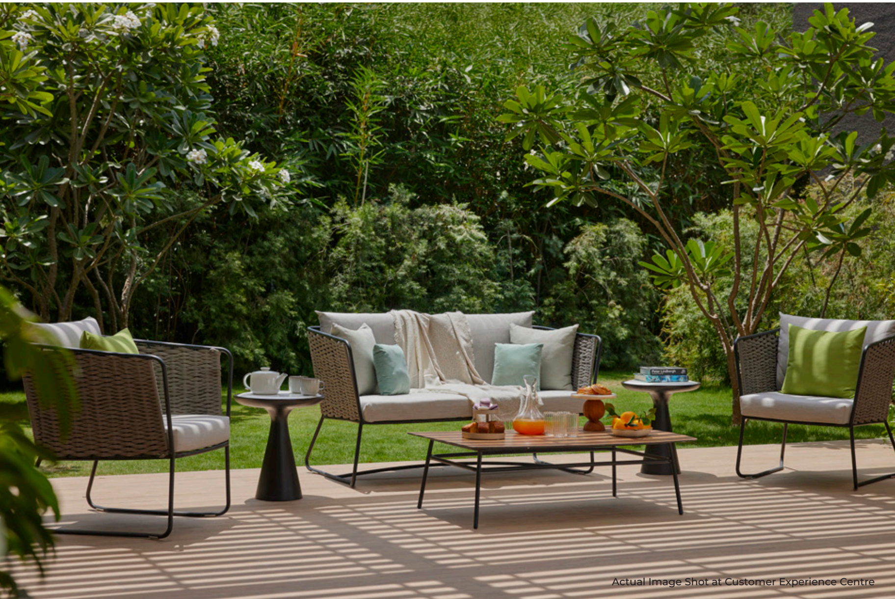
Actual Image Shot at Customer Experience Centre

We are committed to building an eco-friendly way of living. We acknowledge the pivotal role of promoting sustainable living, thus focusing on energy-efficient design and environmentally friendly features that aid water efficiency and waste management.