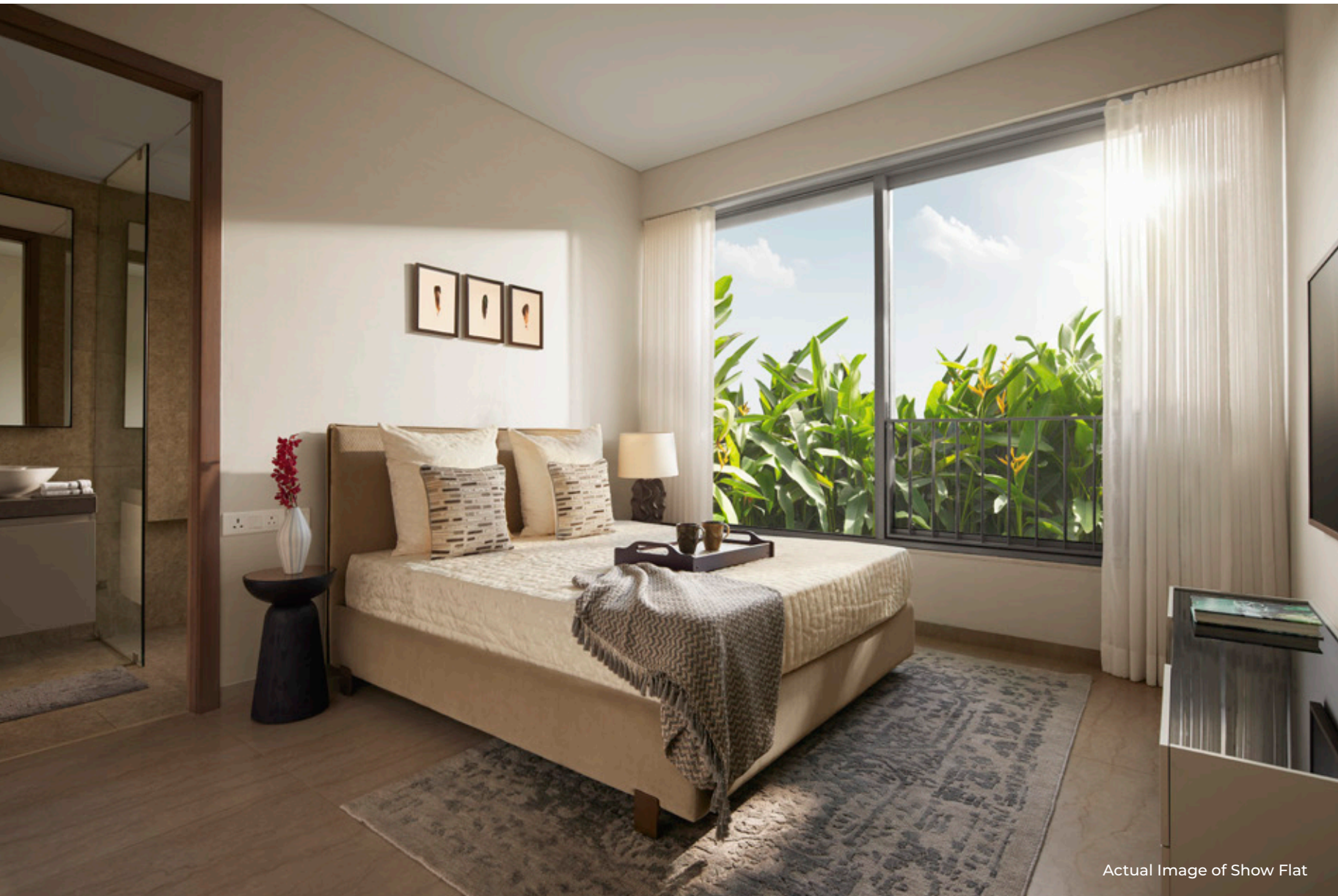
Actual Image of Show Flat

Disclaimer: This advertisement material does not constitute an offer and/or acceptance and/or contract and/or agreement and/or transaction and/or any intention thereof and/or a disclosure under any statute of any nature whatsoever. The pictorial/other representations herein, the layout, number/orientation of buildings/towers/wings/structures, facilities and amenities are merely creative imagination and an Architect's impression and are only indicative, actual product may vary/differ from what is indicated herein. No representation or warranty is made or intended as to the accuracy or completeness of information under this advertisement/promotional document or as to its suitability or adequacy for any purpose. Before making a decision to purchase, you are requested to independently, either directly or through your legal/financial consultants, thoroughly verify all details/documents pertaining to this project as available on https://maharera.maharashtra.gov.in/ under the MahaRERA Registration No. P51700050312. For detailed disclaimers refer to page Disclaimers (Page no. 30) all of which area deemed to be incorporated herein.