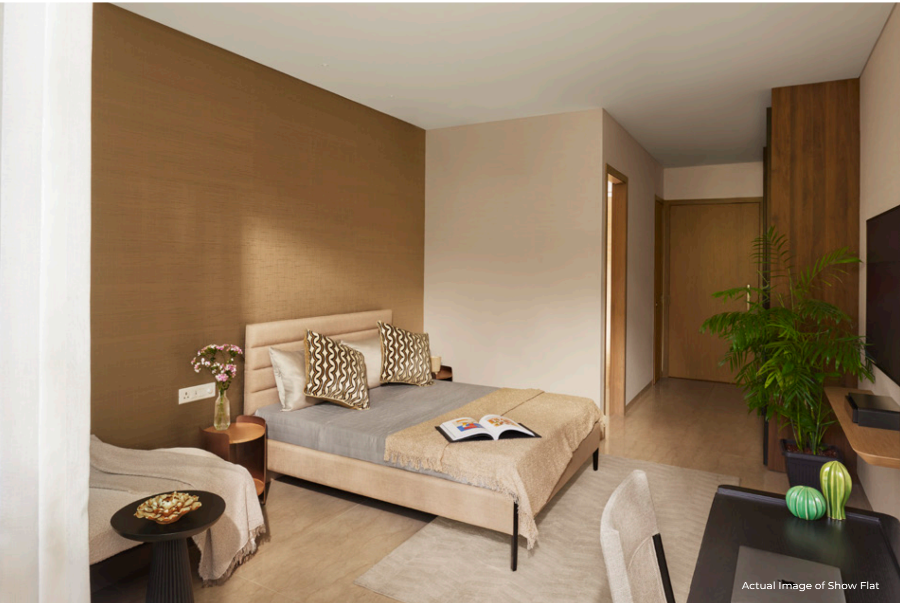
Actual Image of Show Flat

Disclaimer: This advertisement material does not constitute an offer and/or acceptance and/or contract and/or agreement and/or transaction and/or any intention thereof and/or a disclosure under any statute of any nature whatsoever. The pictorial/other representations herein, the layout, number/orientation of buildings/towers/wings/structures, facilities and amenities are merely creative imagination and an Architect's impression and are only indicative, actual product may vary/differ from what is indicated herein. No representation or warranty is made or intended as to the accuracy or completeness of information under this advertisement/promotional document or as to its suitability or adequacy for any purpose. Before making a decision to purchase, you are requested to independently, either directly or through your legal/financial consultants, thoroughly verify all details/documents pertaining to this project as available on https://maharera.maharashtra.gov.in/ under the MahaRERA Registration No. P51700050312. For detailed disclaimers refer to page Disclaimers (Page no. 30) all of which area deemed to be incorporated herein.