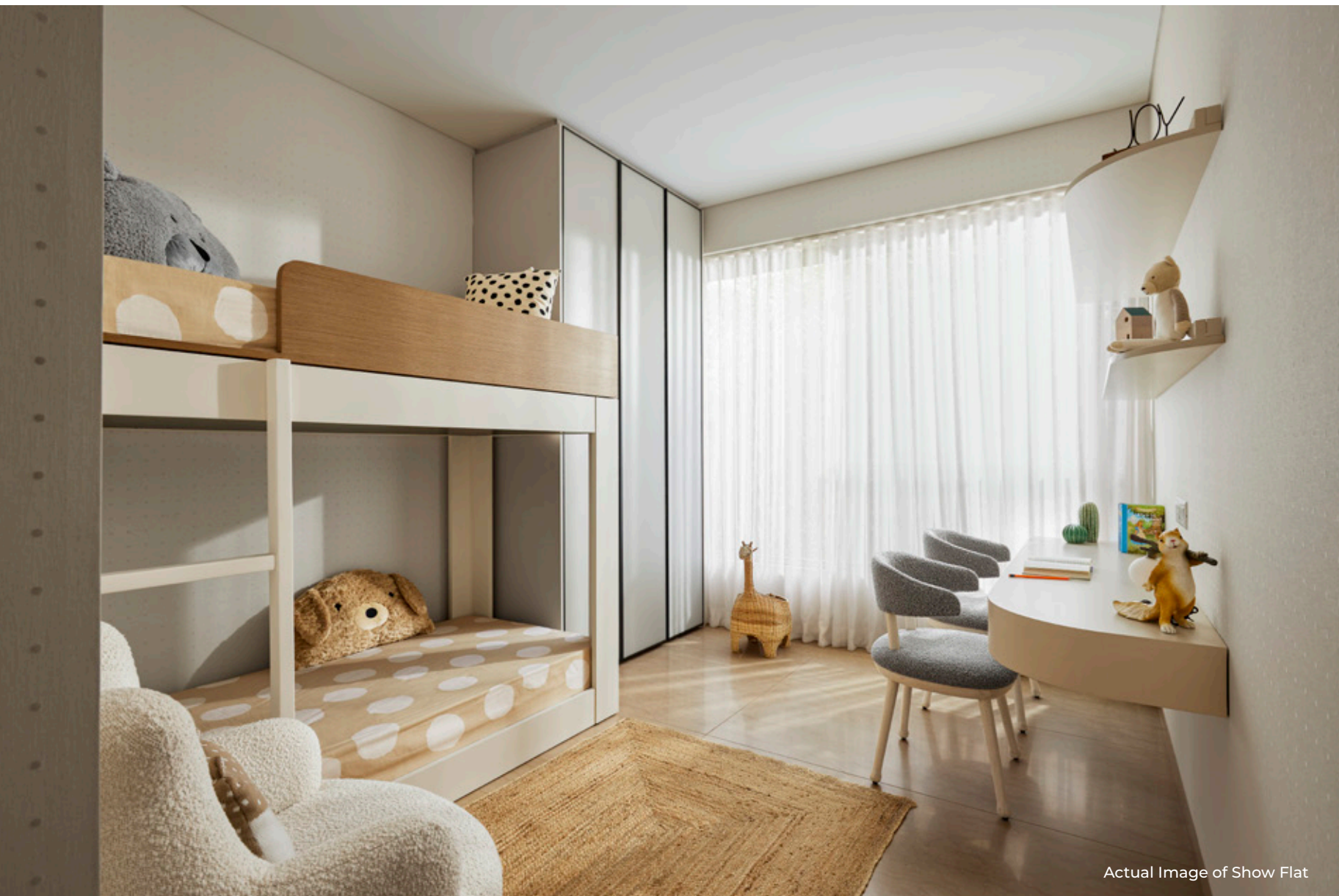
Actual Image of Show Flat

Disclaimer: This advertisement material does not constitute an offer and/or acceptance and/or contract and/or agreement and/or transaction and/or any intention thereof and/or a disclosure under any statute of any nature whatsoever. The pictorial/other representations herein, the layout, number/orientation of buildings/towers/wings/structures, facilities and amenities are merely creative imagination and an Architect's impression and are only indicative, actual product may vary/differ from what is indicated herein. No representation or warranty is made or intended as to the accuracy or completeness of information under this advertisement/promotional document or as to its suitability or adequacy for any purpose. Before making a decision to purchase, you are requested to independently, either directly or through your legal/financial consultants, thoroughly verify all details/documents pertaining to this project as available on https://maharera.maharashtra.gov.in/ under the MahaRERA Registration No. P51700050312. For detailed disclaimers refer to page Disclaimers (Page no. 30) all of which area deemed to be incorporated herein.